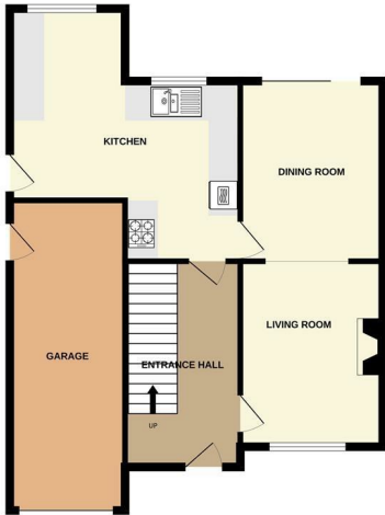
GROUND FLOOR 714 sq.ft. (66.3 sq.m.) approx.